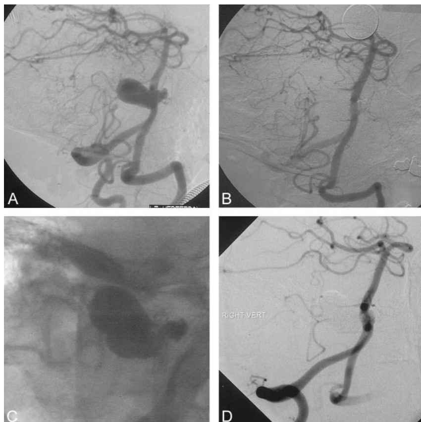
FIG 3. 50-year-old male patient with leg weakness and a possible history of subarachnoid hemorrhage. This patient was found to have a vertebral basilar junction aneurysm compressing the medulla.

A, Pretreatment angiogram showing a large vertebrobasilar junction aneurysm treated on two occasions (treated with an INX stent at the second procedure after recurrence). Complete occlusion was noted at 6-month and 1-year follow-up after second procedure.