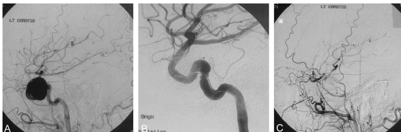
FIG 4. 45-year-old patient presenting with a partial cranial nerve III palsy and headache. No anterior cerebral artery was present on the left side and the carotid only supplied the left middle cerebral territory.

A, Lateral arterial phase carotid angiogram obtained immediately before treatment.