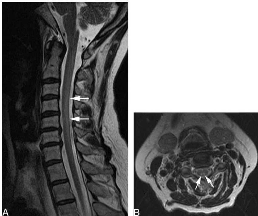
Fig 1. A and B, Sagittal (A) and axial (B) fast spin-echo images of the cervical spine before treatment demonstrate diffuse increase in signal intensity (arrows) involving the dorsal columns of the cervical spinal cord extending from C1 to C7.