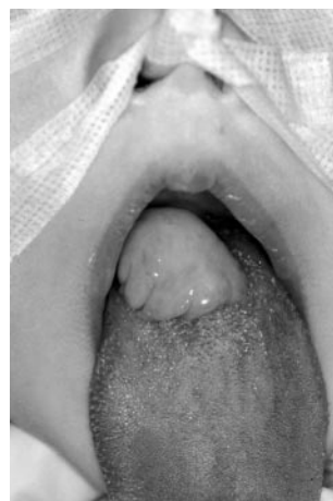
Fig 1. Preoperative photograph of the infant in the operating room after anesthesia induction and nasotracheal intubation, with manual traction applied to the patient's tongue, shows a lobulated midline tongue base mass.

At surgery, the smooth and slightly lobulated mass measured 2.3 \times 2 \times 1.2 cm and arose near the foramen cecum. It was noted to have a short 5-mm-thick stalk, which was amputated by using elec-