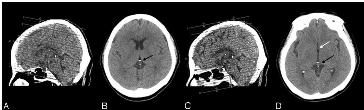
Fig 3. A, Scout topography of OML-based brain CT. B, Brain CT images based on the OML showing only the posterior commissure (black arrow) without inclusion of anterior commissure at the level similar to D. C, Scout topography of TS-OP line-based brain CT showing the scanning reference lines parallel to the line connecting the tuberculum sellae and external occipital protuberance. D, Brain CT image based on the TS-OP line showing both the anterior commissure (white arrow) and posterior commissure (black arrow) at the same level B.