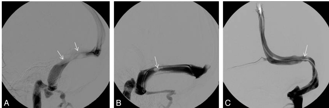
Fig 1. A, Example of a stenosis due to extrinsic compression (long narrowed segment, arrow). B, Example of an intrinsic stenosis caused by a large arachnoid granulation (arrow). C, Example of an intrinsic stenosis caused by a septal band (arrow).

headaches (6 required re-stent placement), which resolved with time in 5 patients. One of these patients required 4 stents but now has normal pressures; another has normal venous pressures, with no gradient after 1 stent; and a third patient had normal pressures after 1 stent but required subtemporal decompression for resolution of headaches. After stent placement, none had visual obscurations, pulsatile tinnitus, or diplopia.