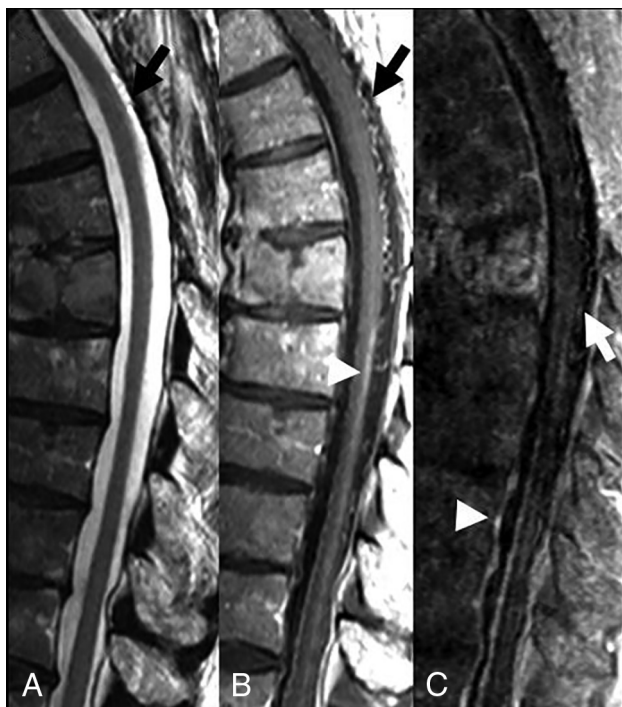
FIG 3. False-positive on MRA. 78-year-old man with prior surgical disconnection of a spinal dural AVF at left T5 level presented with worsening gait spasticity confounded by history of Parkinson disease. Few dorsal perimedullary flow voids were noted on the sagittal T2 (A, arrow), which enhanced on the postcontrast T1 study (B, arrow). Mild intramedullary enhancement was also noted on the postcontrast T1 (B, arrowhead). On MRA (C), there was faint enhancement of the perimedullary veins (C, arrow), which led to the suspicion of residual/recurrent fistula. No fistula was found at subsequent DSA (not shown). The findings on MR imaging and MRA were presumed to be residual changes from prior fistula. Mild enhancement of the perimedullary veins may be a result of venous contamination of contrast bolus, as suggested by enhancement of the basivertebral veins (C, arrowhead).

the first-pass MRA source images revealed diffuse enhancement of the epidural veins at all levels, indicating that the study was timed too late, into the venous phase, likely causing the false-positive diagnosis. If this finding is observed, it should prompt consideration of a repeat study with strict attention to arterial phase timing. Apart from this single case, no other study was affected by contrast timing problems, indicating that the technique is generally robust.