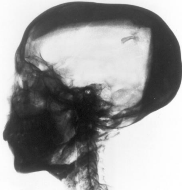
FIG 4. Lateral view radiograph of Tutankhamen's skull and cervical spine with contrast reversed. Intracranial fragments are more conspicuous than on the white on black images.

which are in the right parietal/occipital area, not on the left, as suggested by Harrison. These fragments are separate from the attenuated shadows of the intracranial resin. No other bone fragments or abnormal intracranial contents were detected. The nasal-ethmoid-cribriform plate region appeared to be intact. No fracture or missing parts were noted, in distinction from Harrison's observations. Radio-attenuated material was also seen in both nasal passages. These plugs were placed in the nasal passages to seal the intracranial vault after the embalmers had removed the brain and cauterized the inside of the skull with hot resin, presumably to prevent leakage of resin or liquefied brain. Careful inspection of the bone fragments shown on all three images indicated that the larger of the bone fragments appeared to be a portion of the posterior arch of the first cervical vertebra.