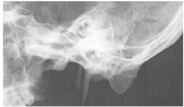
FIG 5. Lateral view radiograph of a slightly tilted skull phantom shows the double contours of the floor of the posterior fossa projecting one cephalad to the other, similar to that seen in the lateral view radiograph of Tutankhamen's skull.

No calcified membrane was seen in the posterior fossa. Two parallel linear opacities in the posterior fossa represented the lateral aspects of the floor of the posterior fossa on which rested the cerebellar hemispheres. Mild tilt of the head on the lateral view radiographs projected the contour of the floor of one side of the posterior fossa above that of the other. A lateral view radiograph of a skull phantom (Fig 5) showed that the parallel lines of the right and left sides of the floor of the posterior fossa project one cephalad to the other when the head was tilted. The appearance of the lateral view radiograph of the phantom was very similar to the appearance of the lateral view radiograph of Tutankhamen, confirming our impression that there was no calcified membrane, as suggested by Brier's consultant (1), but only normal posterior fossa anatomy (except for the resin, as discussed above).