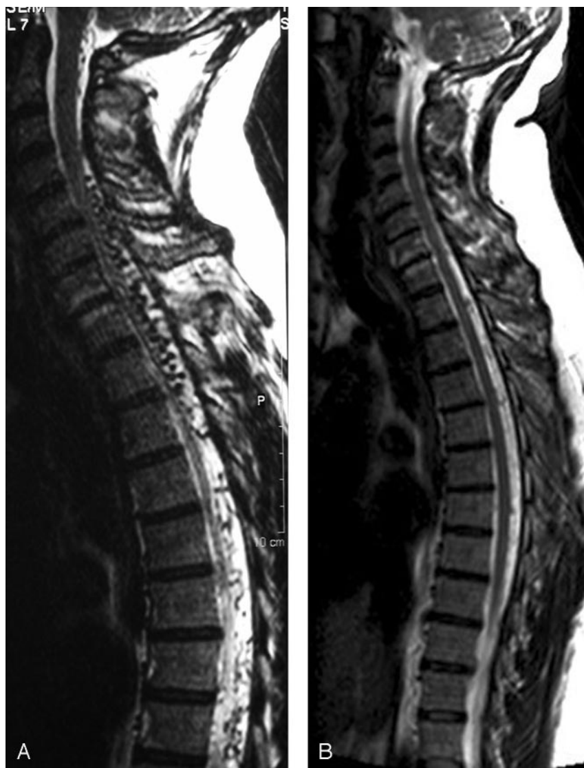
Fig 1. A, MR showing flow voids in abnormal dilated vessels extending from T12 to C4 along the spinal cord.

B, Control MR 8 months after therapeutic embolization showing marked regression of the dilated vessels.