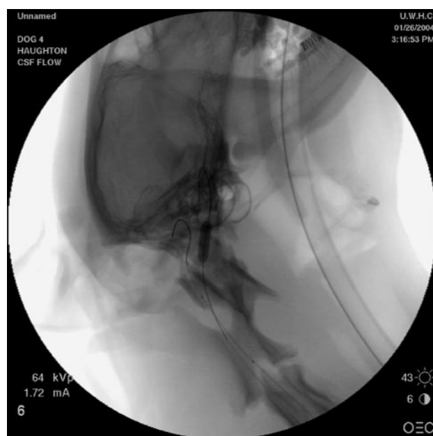
Fig 1. Placement of the balloon catheter and Radi wire in the subarachnoid space in one dog.

The institution's animal research supervisory committee approved the study.