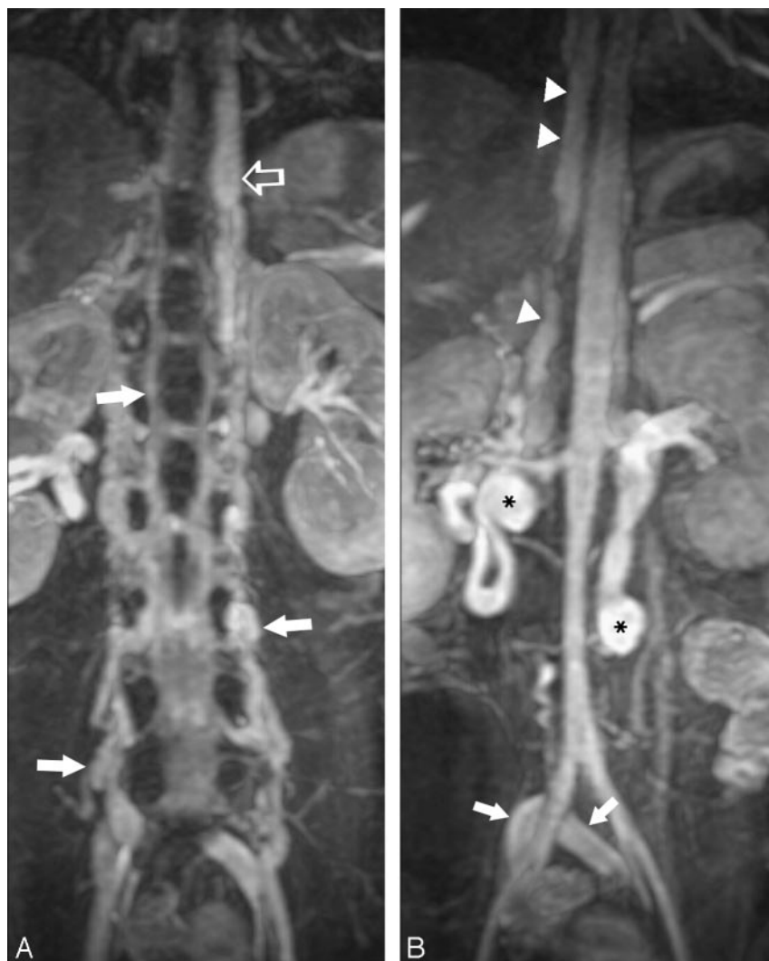
Fig 3. Venous phase of the 3D contrast-enhanced MR angiographic study, on a coronal MIP (maximum intensity projection) images.

A, Enlarged vertebral venous plexus (VVPx) consisting of epidural and paravertebral veins (arrows) extending up to the renal hilus level and consequently draining into the azygos-hemiazygos veins (open arrow).