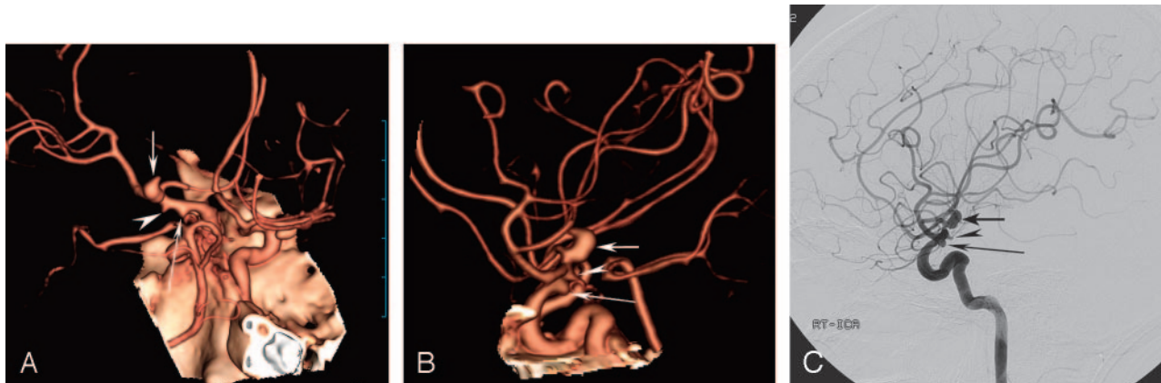
Fig 1. A 72-year-old woman with subarachnoid hemorrhage.

A and B, Volume-rendered MDCTA images obtained with right anterior oblique (A) and lateral (B) projections demonstrate a bilobed aneurysm at the bifurcation of the right internal carotid artery (arrow). There are also 2 small aneurysms at the posterior communicating artery (long arrow) and the anterior choroidal artery (arrowhead). The anterior choroidal artery aneurysm was missed by reader 2 at initial interpretation.