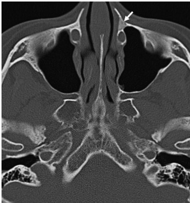
Fig 1. Axial CT image shows the typical pagetoid appearance (type I) (arrow) in the left frontal process of the maxilla.