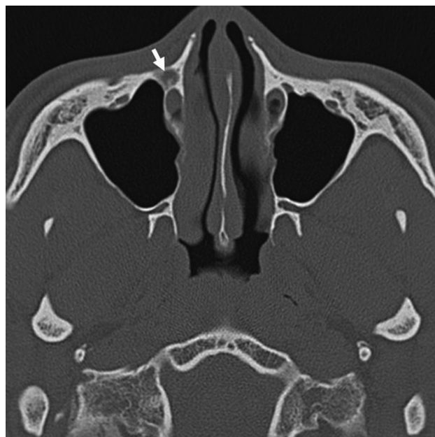
Fig 3. Axial CT image shows the cyst-like appearance (type III) (arrow) in the right frontal process of the maxilla.

these entities did not significantly compress and obstruct the surrounding structures.