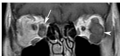
Fig 1. Coronal postcontrast T1-weighted image of the orbits in patient 1 demonstrates a heterogeneously enhancing ovoid lesion involving the right medial rectus (arrow). A similarly enhancing but larger lobulated lesion involves the left lateral rectus (arrowhead).