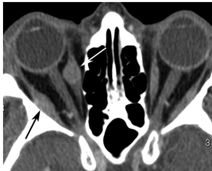
Fig 4. Axial contrast-enhanced CT image of the orbits in patient 6 shows ovoid well-defined lesions of the right medial (black arrow) and lateral (white arrow) recti.