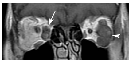
Fig 1. Coronal postcontrast T1-weighted image of the orbits in patient 1 demonstrates a heterogeneously enhancing ovoid lesion involving the right medial rectus (arrow). A similarly enhancing but larger lobulated lesion involves the left lateral rectus (arrowhead).