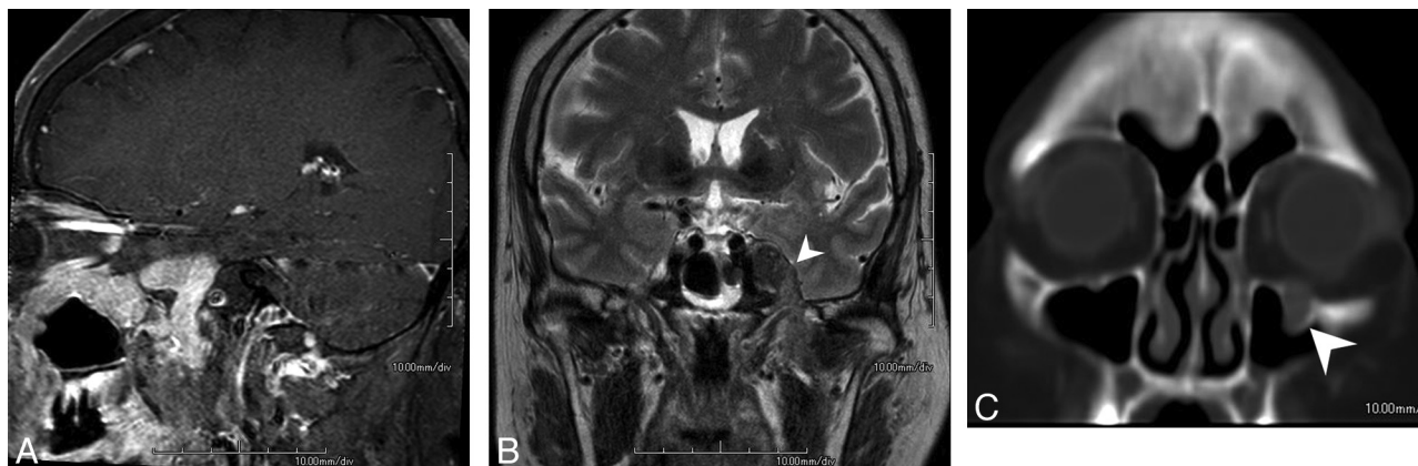
Fig 1. A, MR image reveals a homogeneously enhancing soft-tissue mass involving the skull base along the second and third divisions of the left trigeminal nerve. B, T2-weighted image demonstrates a hypointense mass (arrowhead) extending to the left masticator space via the left foramen ovale. C, CT scan in a bone algorithm shows enlargement of the left infraorbital canal (arrowhead).