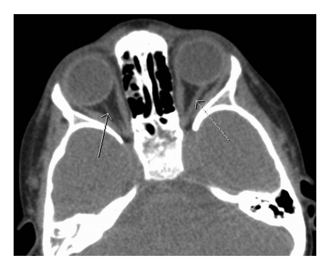
Fig 2. Axial unenhanced CT scan of the orbits at the level of the greater sphenoid wing demonstrates accessory extraocular muscles (arrows) medial to the lateral rectus muscles and lateral to the optic nerves (not shown on this image) that arise from the orbital apex at the annulus of Zinn and insert directly on the posterior globe, with no bridging connection or assimilation into the surrounding muscles.

markedly. The thin sliver of tissue within the contralateral right orbit was not resected because it did not cause any clinical abnormality.