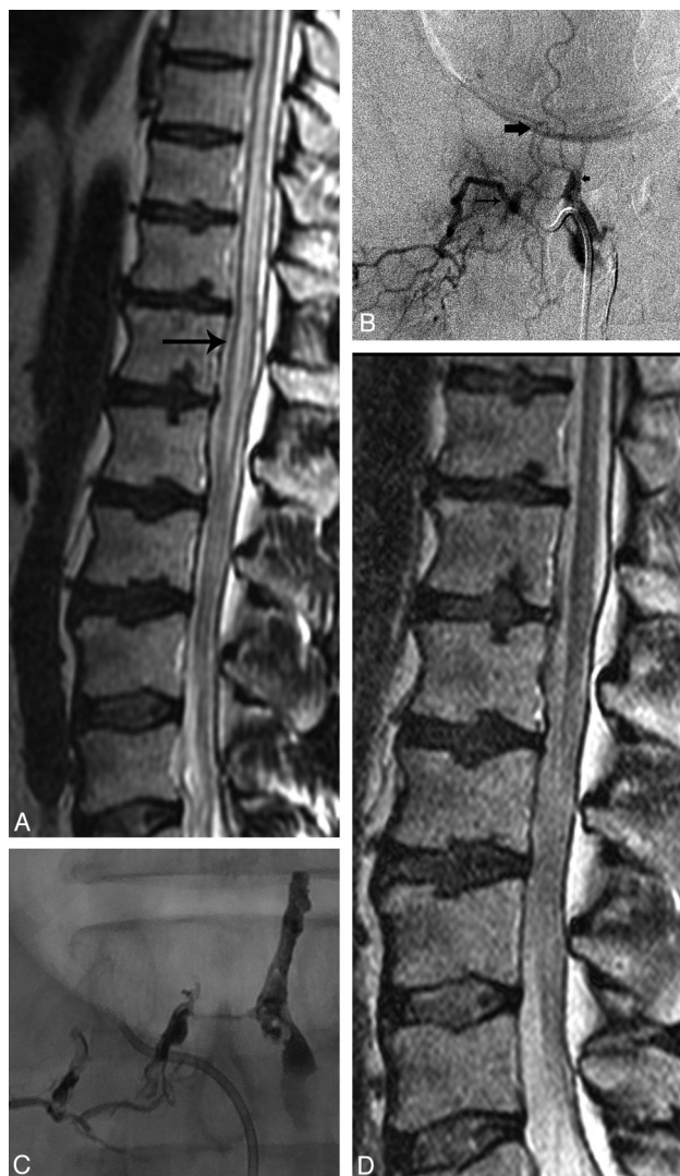
FIG 2. Patient 1, a 59-year-old man with inability to stand and persistent retention. A, Sagittal T2-weighted MR image shows high signal within the conus medullaris, lower and midthoracic spinal cord (arrow). B, Right T12 angiogram shows filling of an SDAVF (small arrow) with initial filling of the epidural venous plexus (small arrow), which then fills the radicular veins (large arrow). C, Frontal spot fluoroscopic images showing Onyx cast. D, Sagittal T2-weighted MR image 3 months after treatment shows interval resolution of the high signal within the conus medullaris, lower and midthoracic spinal cord.

embolization was attempted; however, there was poor penetration into the draining radicular vein and we were concerned about non-target embolization into the main vertebral artery, necessitating surgery. The fifth patient (Patient 16) had an SDAVF at L2 that was successfully treated with Onyx, with good penetration into the draining radicular vein. However, follow-up angiogram at 6 months demonstrated development of a collateral vessel to the fistula at L3, and surgery was therefore performed. One patient had improvement in motor strength on the ALS scale, and 4 (80%) of 5 patients demonstrated stable motor strength. According to MC grading, 2 (40%) of 5 patients had improvement and 3 (60%) of 5 had no change. On mRS assessment, 1 (20%) of 5 patients had improvement and 4 (80%) of 5 had no change.