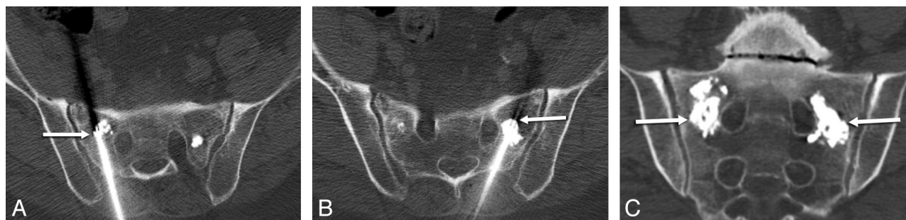
FIG 1. Percutaneous CT-guided sacroplasty. Intraprocedural axial CT images during PMMA injection (A and B). The needle tip position is identified by the presence of beam-hardening artifacts (arrows) with adjacent PMMA deposition. Final postprocedural coronal CT image (C) reveals satisfactory PMMA deposition (arrows), with no extravasation into the sacral neural foramina.