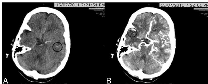
FIG 1. A 67-year-old woman with left hemiparesis and dysarthria who presented to the hospital 2 hours after onset. CTA identified a right intracranial ICA occlusion. CTP-SI showed that the contrast (black circles) was first detected at 20 seconds in the left Sylvian fissure (A) and at 27 seconds in the affected right hemisphere (B). The relative filling time delay was, therefore, 7 seconds.